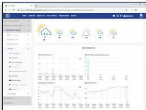
High-resolution weather forecasting was implemented to provide precipitation forecasts to the combined sewer system.

The main challenge in the implementation of the system was the city water cycle scale, which requires detailed resolution for many models and domains, including meteorology, water supply, sewer, and storm drainage. The city water scale also required the ability to consume large amounts of data from real-time sensors and consumers' telemetry and billing.