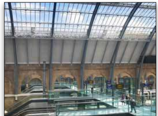
Lifelike rendering of the project helped clearly communicate design intent with stakeholders.

The station remodel has enhanced passenger amenities, rationalized operational activities, and significantly increased retail space. In addition, John McAslan + Partners played a key role in the wider transformation of the King's Cross area. This included improved infrastructure, social, and commercial changes that now connect the station with the substantial King's Cross Central scheme to the north, as well as improved interchange links with the London Underground, St. Pancras station, Thameslink services, taxis, and buses.