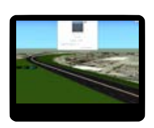
VISUALIZE AND ANIMATE THE MODEL