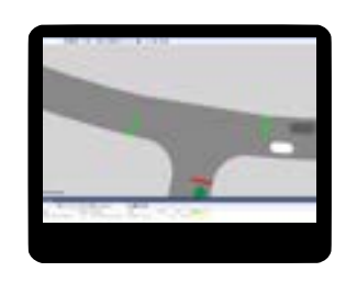
TRAFFIC ANALYSIS AND FLOW VIA VISSIM