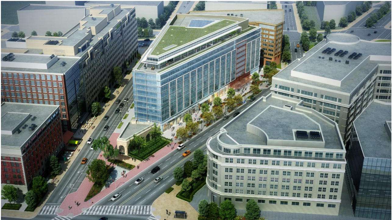
High Res Image of RMR 20 Massachusetts Ave., NW Repositioning