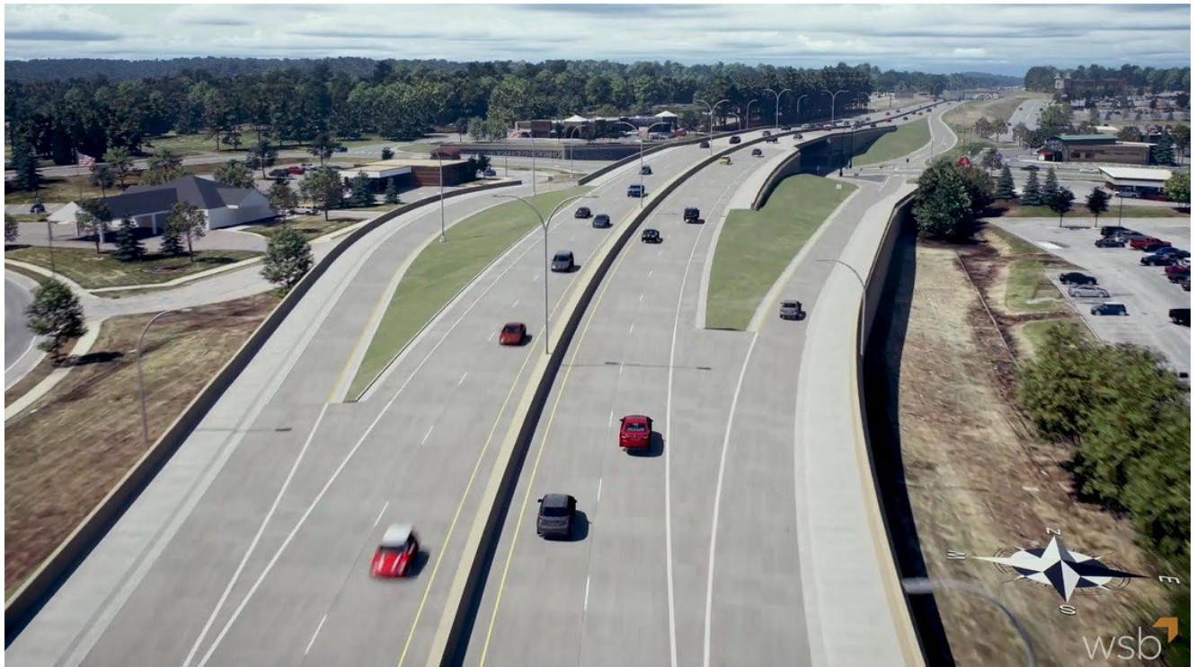
High Res Image of Digital As-built Proof of Concept