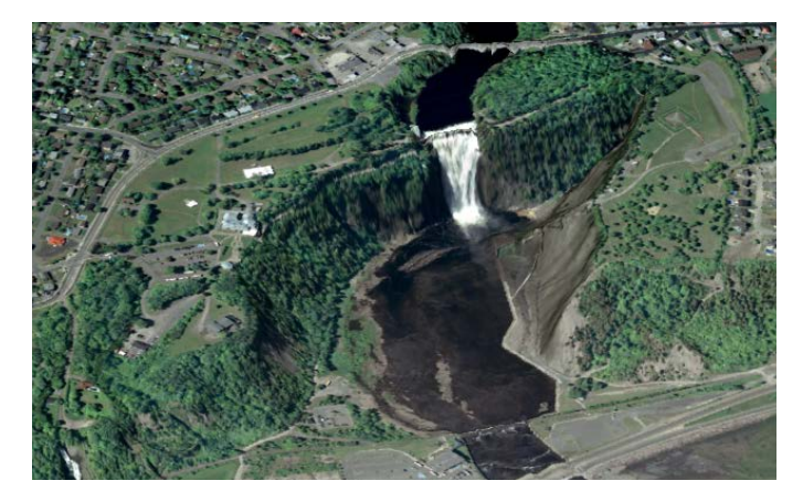
You can drape aerial photographs on scalable terrain models.

Reality meshes are rich, 3D scalable models of the real world, which are usually phototextured and automatically created from imagery ranging from simple smartphone photos to high-end photogrammetric cameras by using Bentley's iTwin® Capture. Bentley Descartes enables quick and easy manipulation of meshes of any scale, and can generate cross sections, extract ground and breaklines, and produce orthophotos, 3D PDFs, and iModels. In addition, you can integrate meshes with GIS and engineering data to enable intuitive search, navigation, visualization, and animation of that information within the visual context of the mesh.