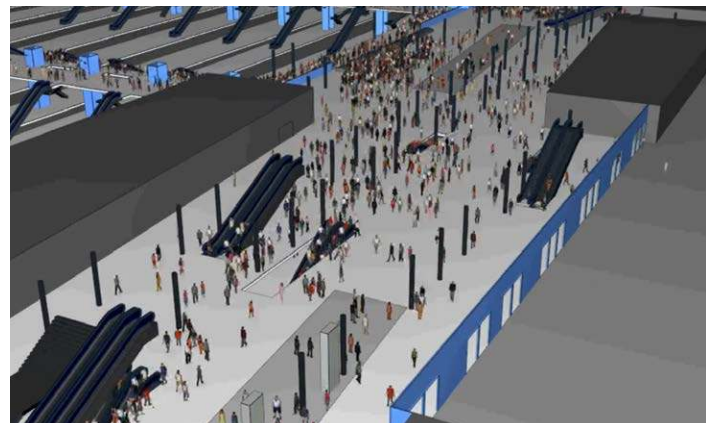
The passenger simulation informed the station's final configuration, ensuring smooth operations during peak volume.