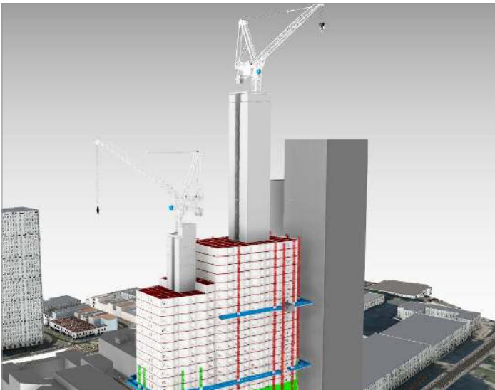
The team used SYNCHRO to create a 4D BIM model where they could visually demonstrate their plan to stakeholders.

Because Tantek 4D implemented SYNCHRO applications as part of their 4D BIM offering, the organization can now compete—and win—this type of work on a global scale. "By implementing SYNCHRO 4D into our business, we have increased our client base by 100% in the past year," said Tansey. Moving forward, the organization plans to integrate more SYNCHRO applications into this project, which will allow them greater capabilities to monitor progress and optimize task completion.